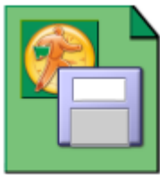
AssocPM2009 Template (Backup Jul 16, 2009 06 39 AM)